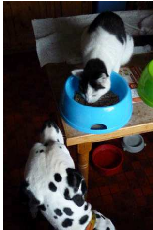
Me eating the dog food before he can.