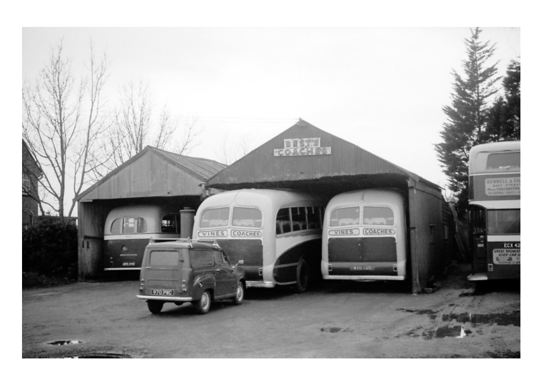
Vines Bus Station in March 1965