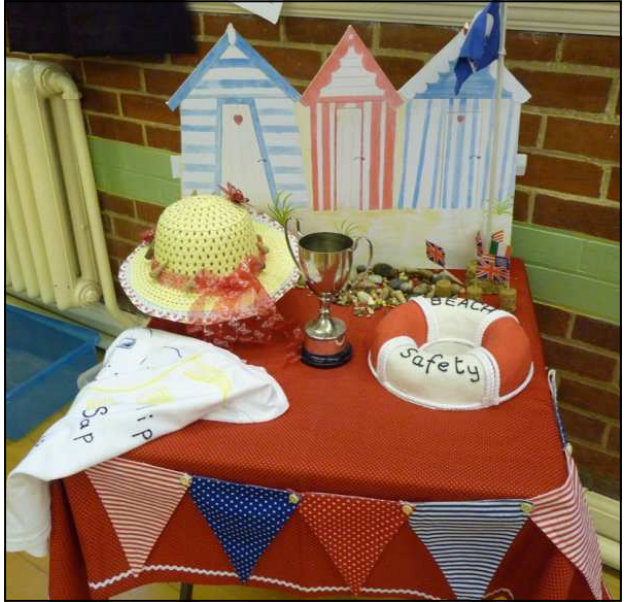
Great Bromley WI's winning competition piece "The Beach" for the Annual Constable Group Meeting this year held at Dovercourt

Care line is not just for the elderly it is for any member of society that is at risk, such as a young mother / father who has a life threatening illness or who also have young children in the house.