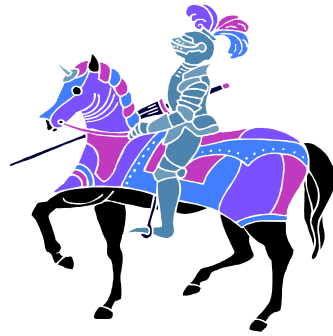
St. George The Martyr Badley Hall Road Great Bromley, Essex