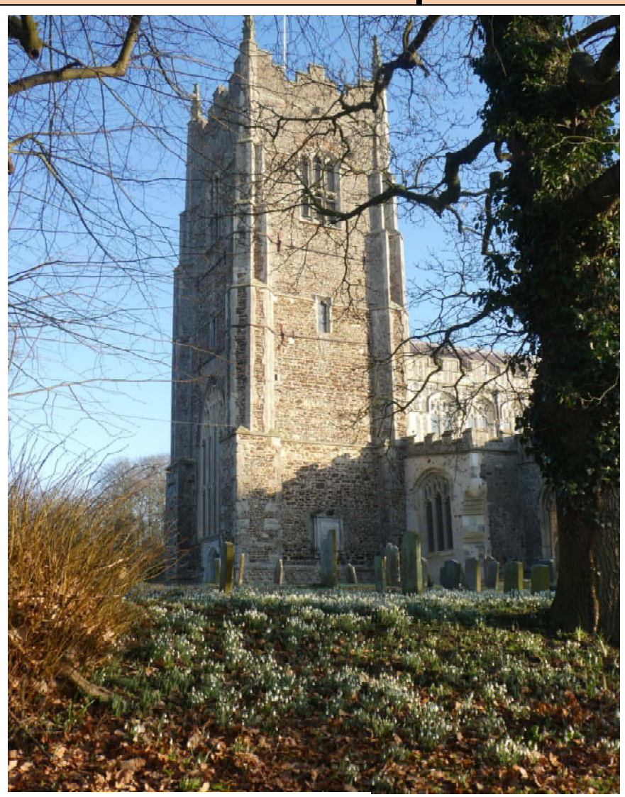
Snowdrops at Great Bromley church