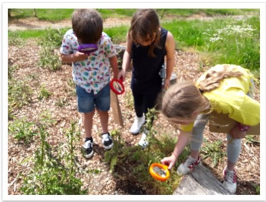
Pupils from St George's exploring