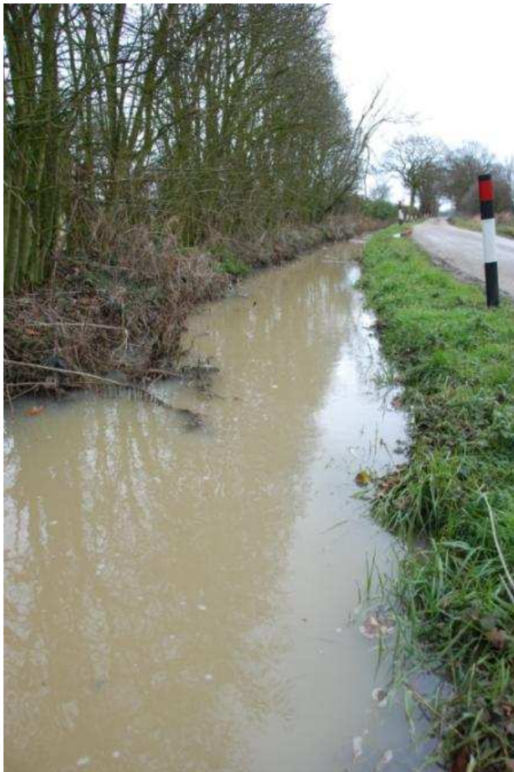
Ditch alongside Spratts Lane