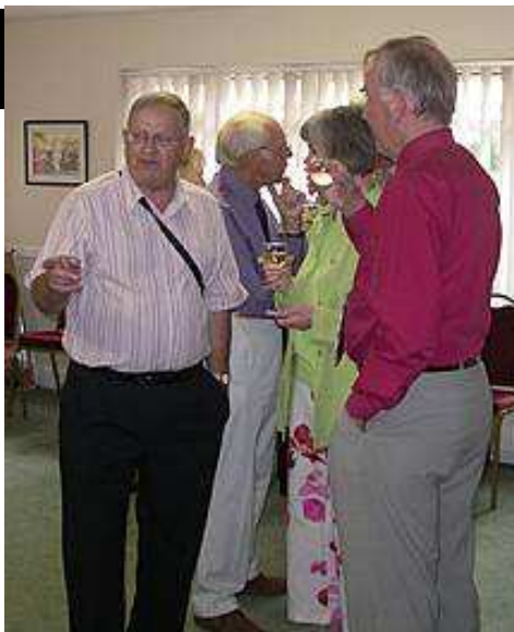
Photo taken at the BM anniversary party in 2006