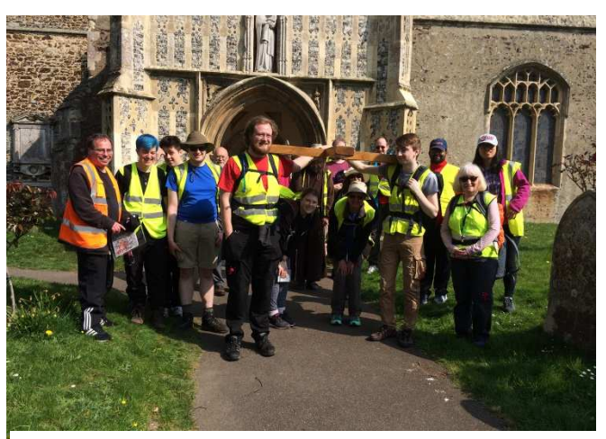
The Student Cross arriving at St George's church

01206 392659 <u>www.lawfordchurch.co.uk</u>