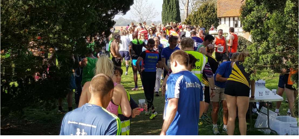
Lt Bromley churchyard flooded with hot runners Full report inside