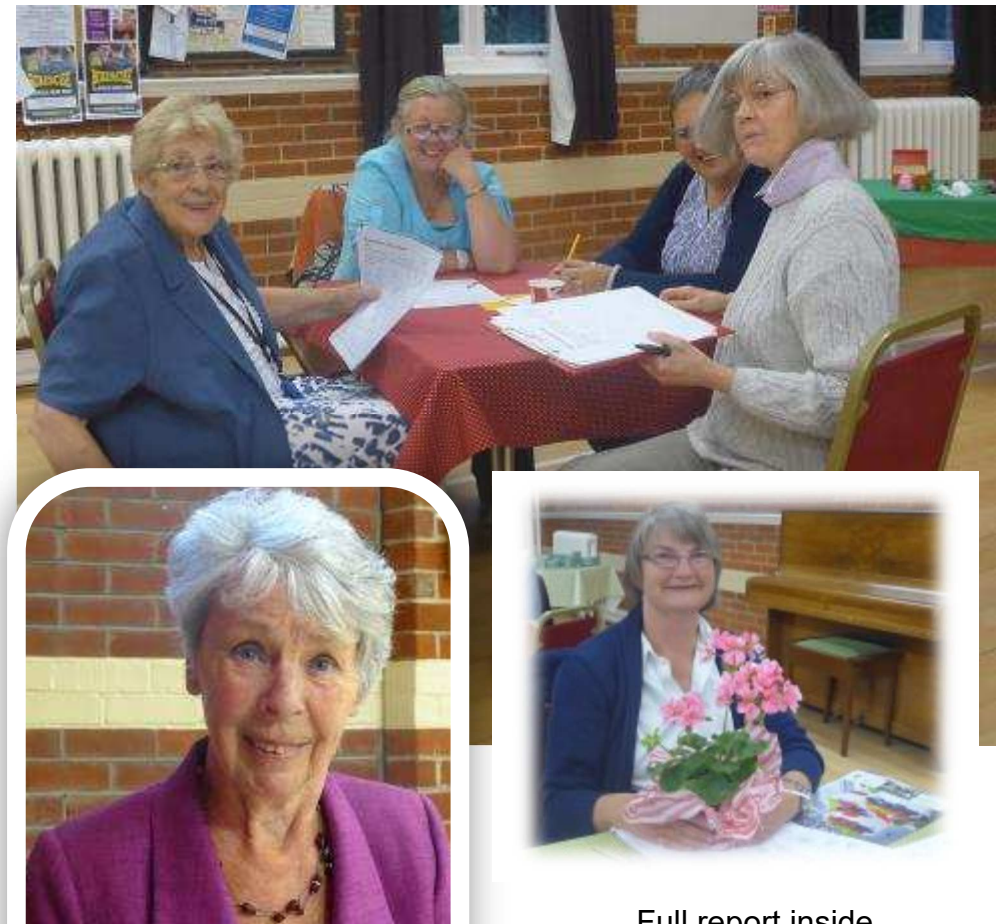
Full report inside