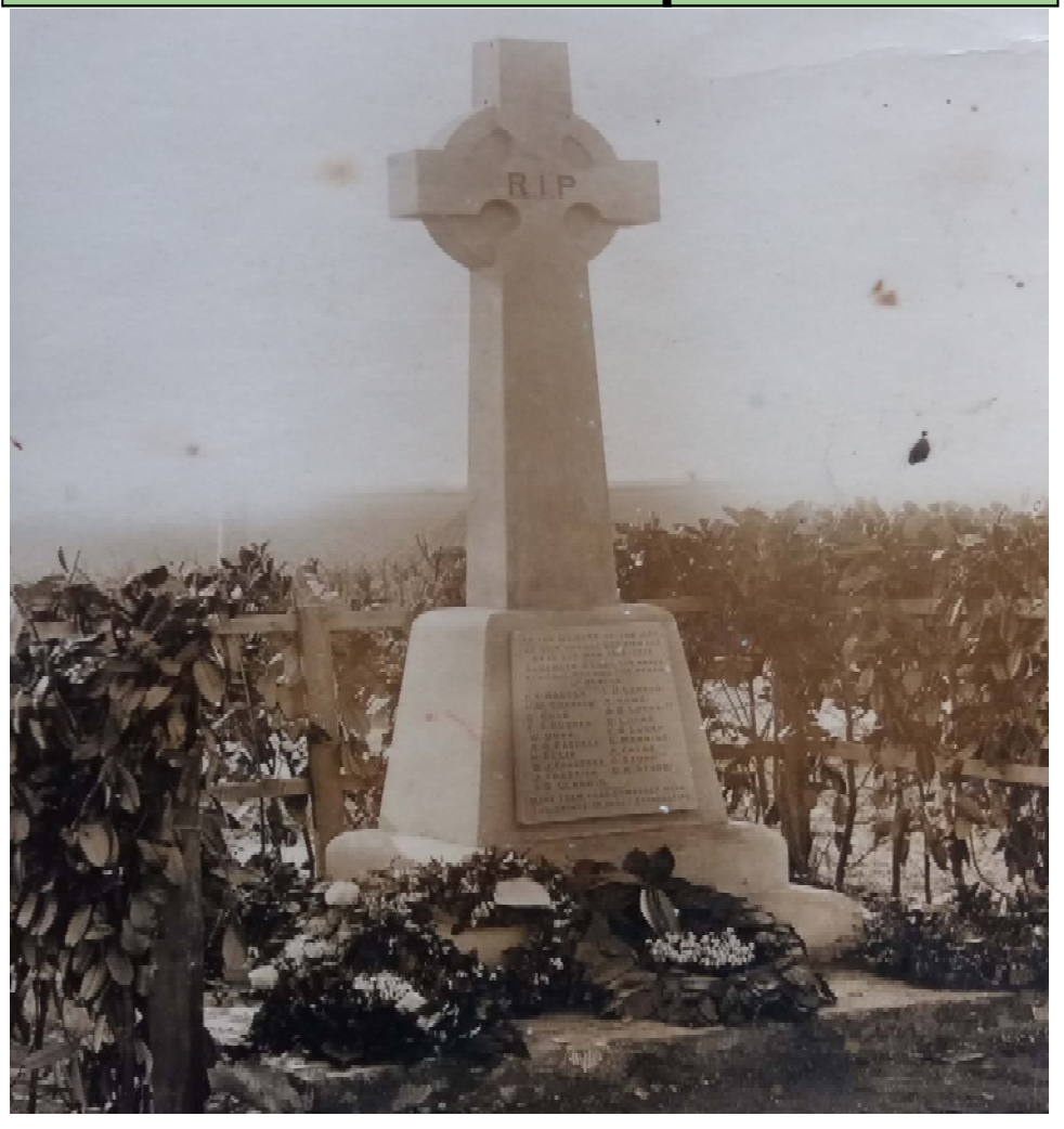
Little Bromley War Memorial

Year photographed and by whom unknown to Editor